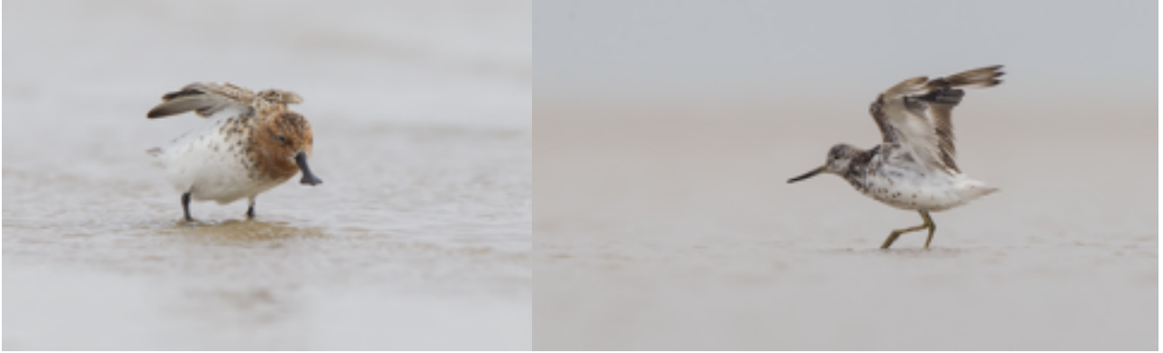
Spoon-billed Sandpiper Nordmann's Greenshank by Luke Tang

Bird watching while helping to conserve the migratory shorebirds in China